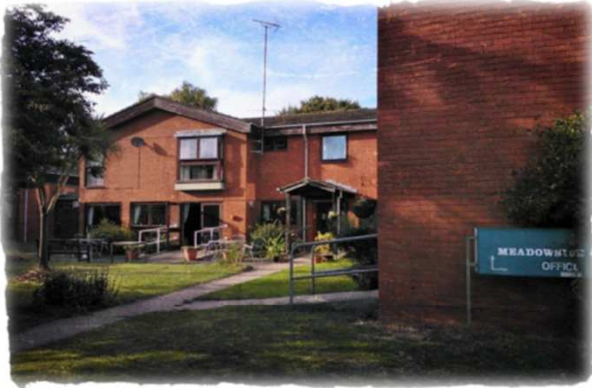
Meadowside – Walmer 22 Bedded Unit