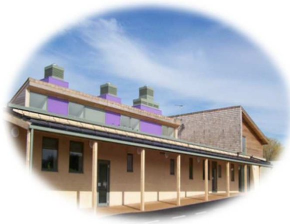
Windchimes – Herne Bay 6 Bedded Unit Jointly funded by KCC and Health Authority