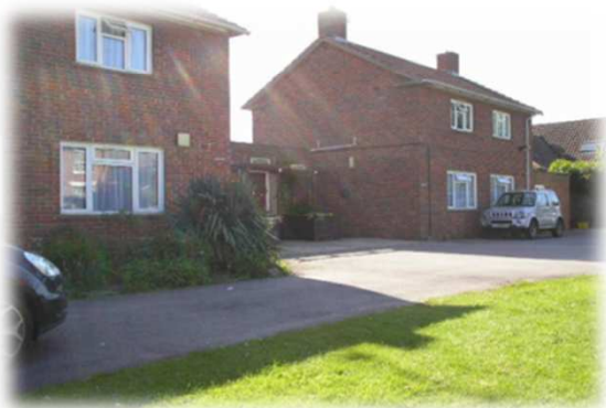
Hedgerows Staplehurst 5 Bedded Unit