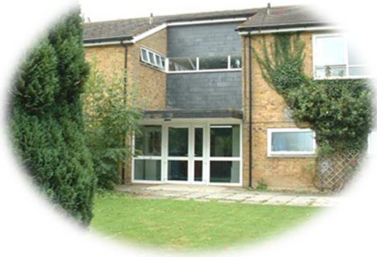
Fairlawns – Ashford 7 Bedded Unit