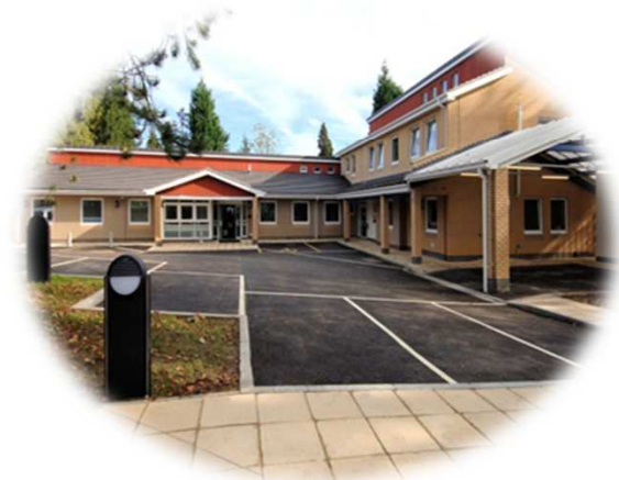
Sunrise Centre – Southborough 6 Bedded Unit