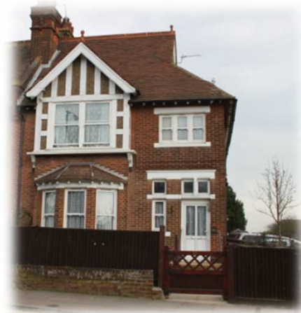
Canterbury ASU – Canterbury 5 Bedded Unit