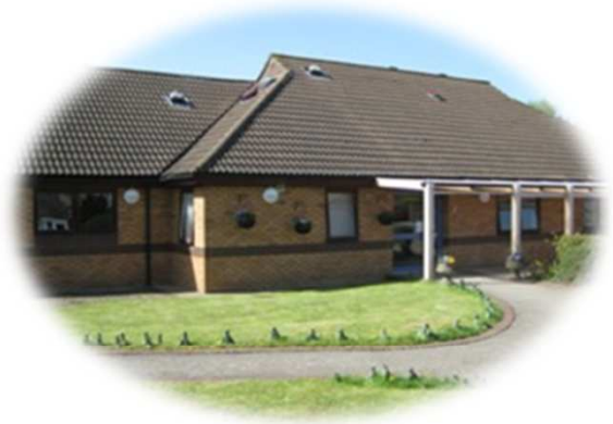
Treetops – Dartford 6 Bedded Unit