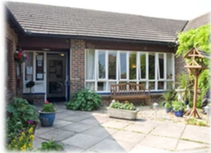
The Birches, Tonbridge 3 Bedded Unit