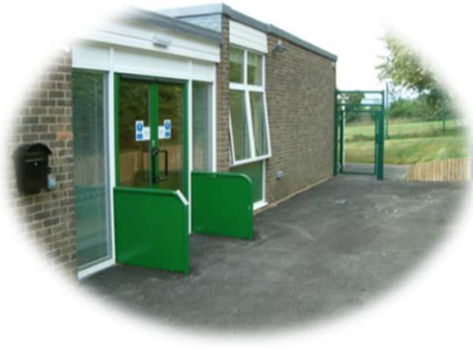
Bluebells – Maidstone 4 Bedded Unit