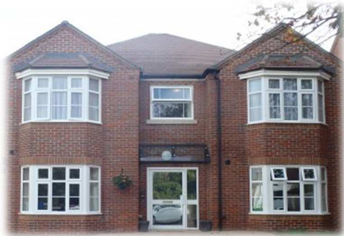
Rusthall Respite, Tunbridge Wells 5 Bedded Unit