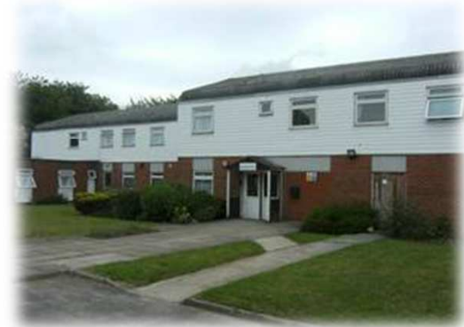
Osborne Court – Faversham 13 Bedded Unit