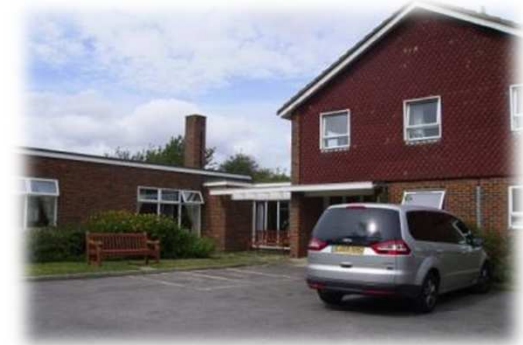
Southfields – Ashford 15 Bedded Unit